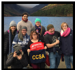
Great use of the CCSA Towel!!

The Winter 2016/2017 programs to London and Dublin have all returned safely. Our Storyteller scholarship winners are working to finalize their stories and we will share these in the next edition of our newsletter. Thank you to everyone that participated in making this program a success. CCSA's program administrators and faculty did a great job running the winter program!